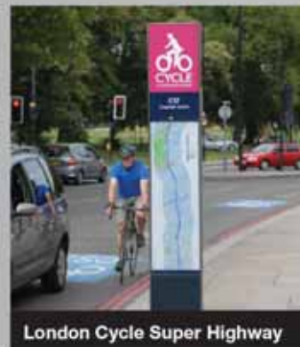
London Cycle Super Highway