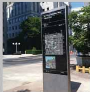
New York Wayfinding